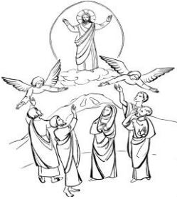
The Ascension of the Lord

OUR MISSION STATEMENT - Saint Agatha Parish is centered on the living Word of God and Christ's Eucharistic presence in the Liturgy. We are committed to evangelization through Catholic education and faith formation. By spreading the Good News of God's love and salvation, we encourage adherence to the greatest commandments: love of God and neighbor. We welcome new disciples to the Catholic Church and promote the culture of life, peace and justice.